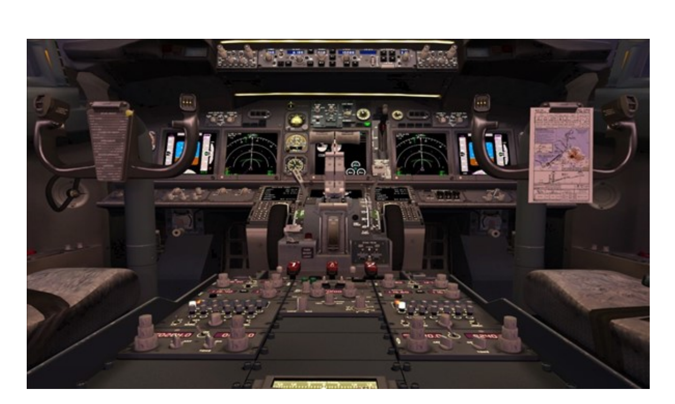
Fsx Sp2 Activation Key Full Added By Users